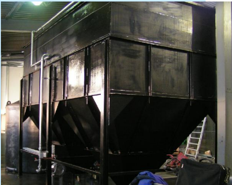
Pre-sedimentation tanks with lamella clarifier in a Coca Cola Plant