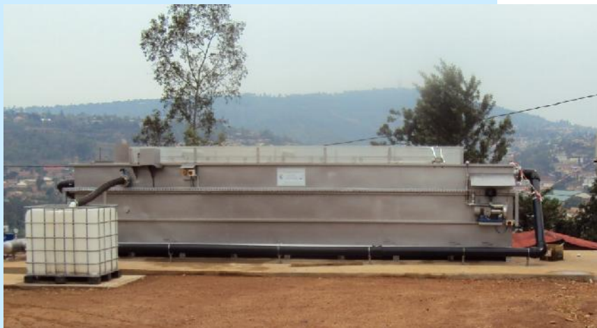
Aerated FOG separator