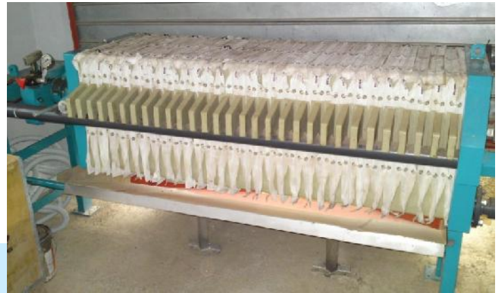
Sludge dewatering system – Chamber Filter Press